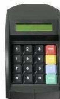
Phase 2 EMV2000 PIN Pad Required

At the teller position the POS Compact Modular Post Office Keyboard is specifically designed for retail post office applications. The unique, integrated, design allows an easy migration and a cost effective path for post offices changing, or upgrading, their teller platform, especially when implementing smart cards.